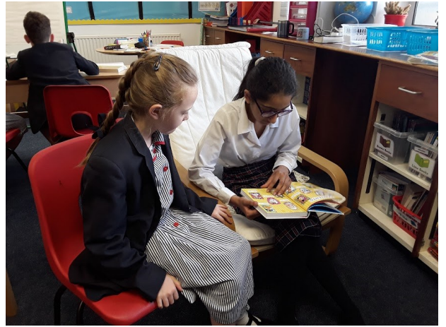
Year 3, 4, 5 and 6 love to spend time reading together during our reading buddies time